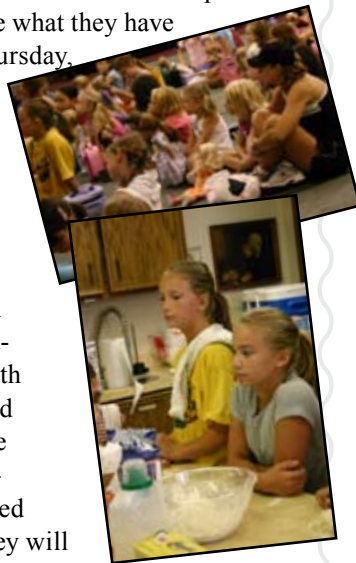
Photos from last year's Girls camp.

The following week, more than 60 girls will attend one of the Girl's HerStory camps where an American historical time period will be emphasized each day. The week begins with the American Revolutionary War and ends with life in the present day. The girls will discover how God has sustained, upheld, blessed, led and helped people throughout the centuries. They will also begin to see their roles in history.